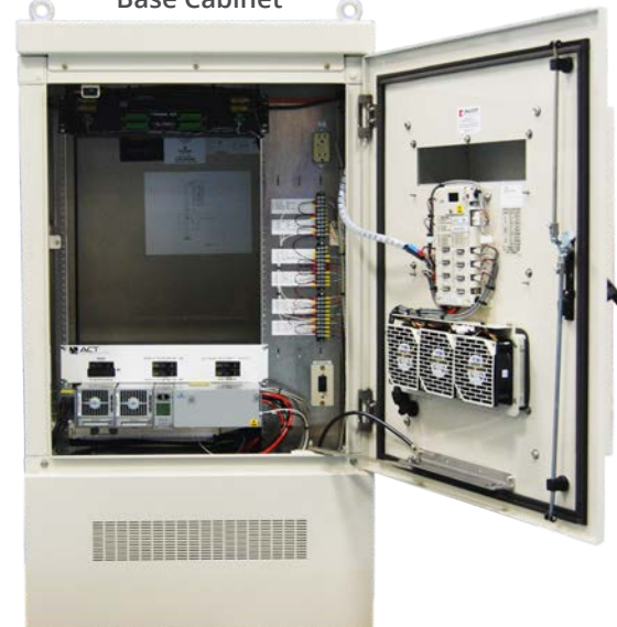
Mobile Backhaul Base Cabinet